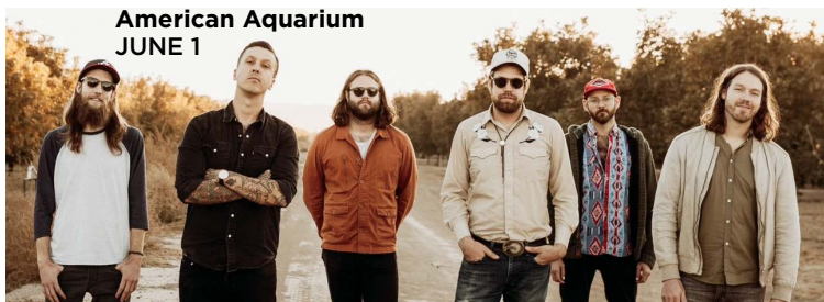
American Aquarium JUNE 1